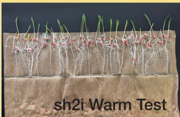
sh2i Warm Test