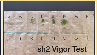
sh2 Vigor Test

The sh2i Series has an advantage over sh2 seed in the level of activity and performance of the seed during germination and more potential for rapid uniform emergence and development of normal seedlings under a wide range of field conditions.