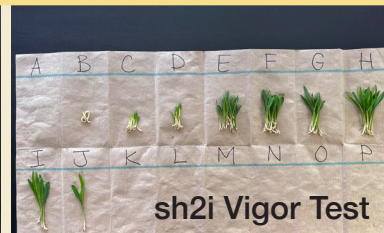
sh2i Vigor Test